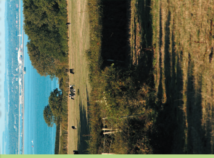
Liz Vinycomb Designs 01983 760944